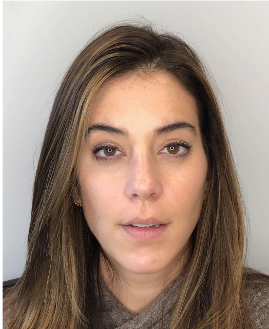
Lips at rest