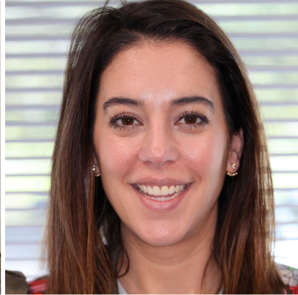
Smile with teeth separated