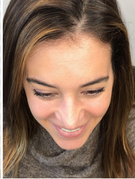
Six O' Clock